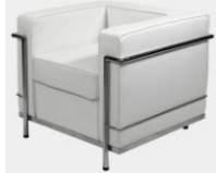
White Contemporary Club Chair