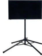
42" Flat Screen & Floor Stand