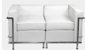
Contemporary White Leather Love Seat