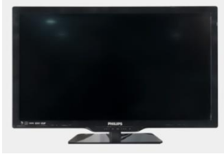
32" Flat Screen Per Day