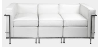
Contemporary White Leather 3 Seat Sofa